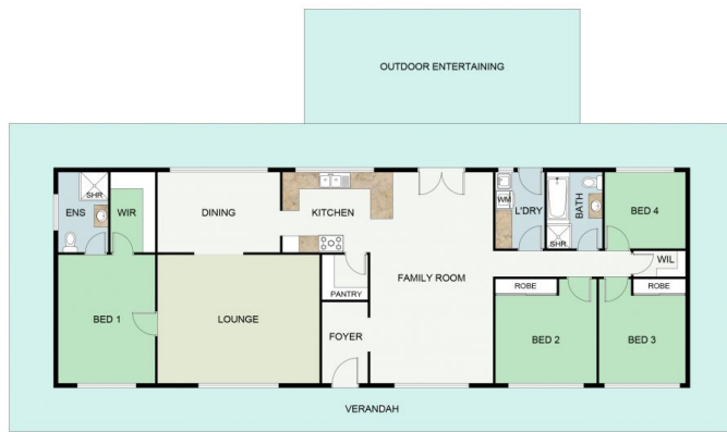
MAIN HOUSE FLOOR PLAN