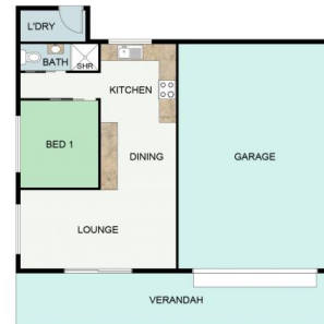
STUDIO / GARAGE FLOOR PLAN